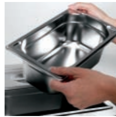
Supplied with stainless steel GN containers