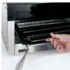
Model LGT supplied with grill pan and toasting rack