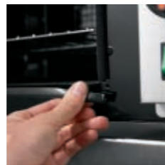
User-replaceable door seals