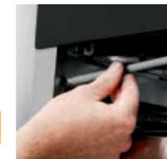
User-changeable quartz infra-red elements