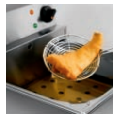
Large tank in LFF is ideal for free frying