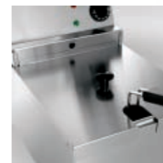
All Lynx 400 fryers are supplied with lids