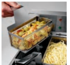
Optional half-size basket inserts (BA158) for cooking individual portions