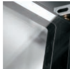
Energy-efficient double-glazed door