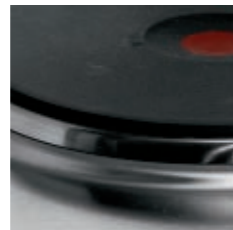
Sealed hotplates for easy cleaning