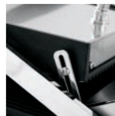
Retaining mechanism holds plate in perfect position