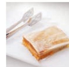
Optional toasting bags (TO10)