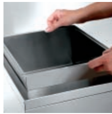
Removable tank allows wet heat models to be operated with dry heat