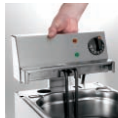
Control head fits securely in place