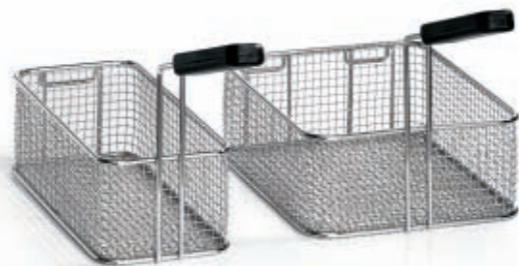
Supplied with chrome-plated wire mesh baskets