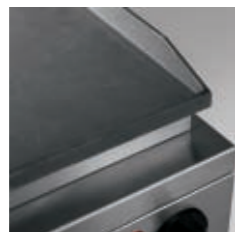
One-piece cast iron griddle plate