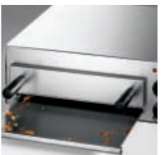
Large crumb tray for easy cleaning