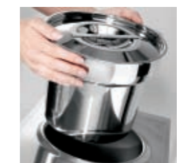
Supplied with stainless steel round pots