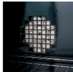
Efficient fan gives fast, even cooking