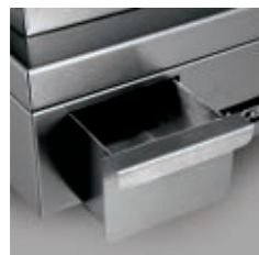
Large fat collection drawer