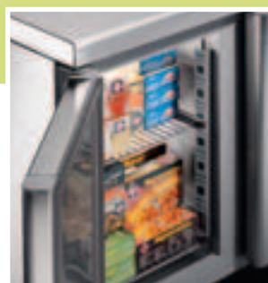
Vano GN1/1 GN1/1 room