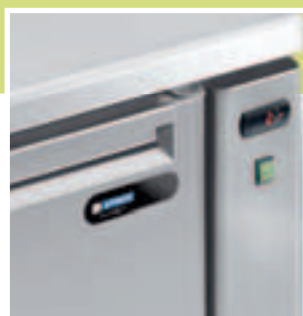
Pannello di controllo per modelli predisposti senza gruppo Control panel for models without unit