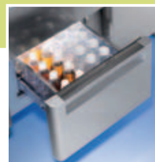
Profondità utile dei cassetti GN1/1 (1/3=cm 12, 1/2=cm 23, 2/3=cm 34) Usable depth of the GN 1/1 drawers (1/3=cm 12, 1/2=cm 23, 2/3=cm 34)